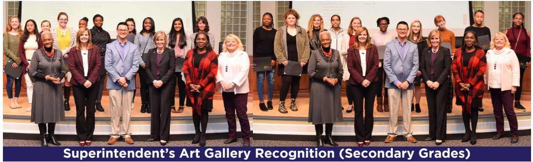
Superintendent's Art Gallery Recognition (Secondary Grades)