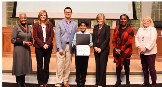
School Bus Safety Poster Winner