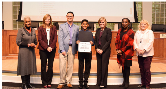
School Bus Safety Poster Winner