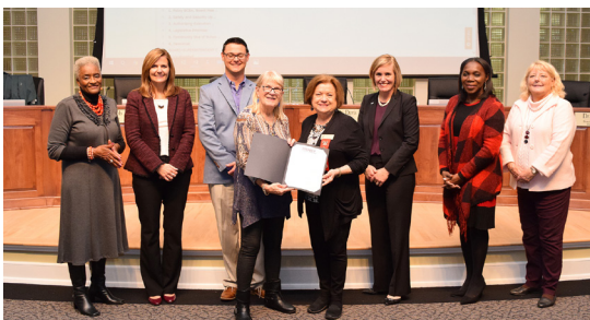
Retired Educators Day/Proclamation