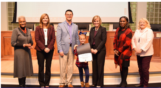
School Bus Safety Poster Winner