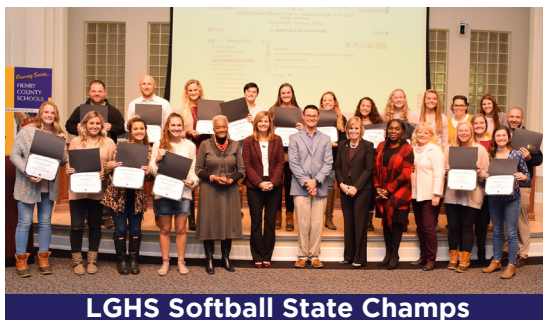
LGHS Softball State Champs